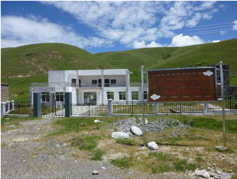
Photo 5. The new administrative building of the Nomadic Settlement programme in Mañijango (2013)