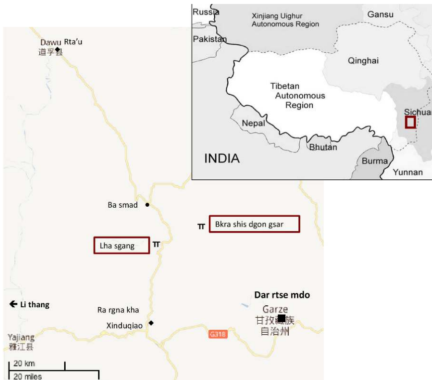
Map 1. Geographical situation of Lhagang, Kham Minyag, in Tibet