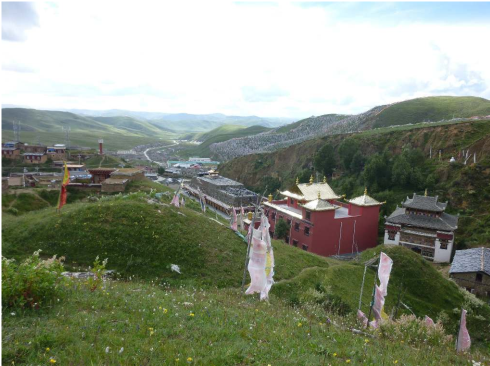
Photo 4. The site of Mañijango with the old and the new temple in the foreground and the village stretching down the valley (2013)