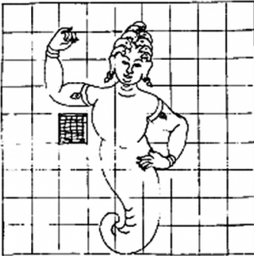
Fig. 3 — The authors credit Meyer’s informant, the Tibetan doctor Amchi Kunsang, with the illustration