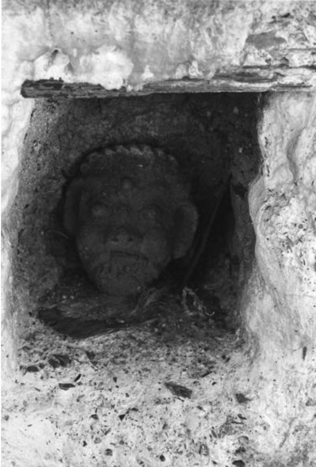
Fig. 3 — The mask made of clay kept in the Lchags rang shrine