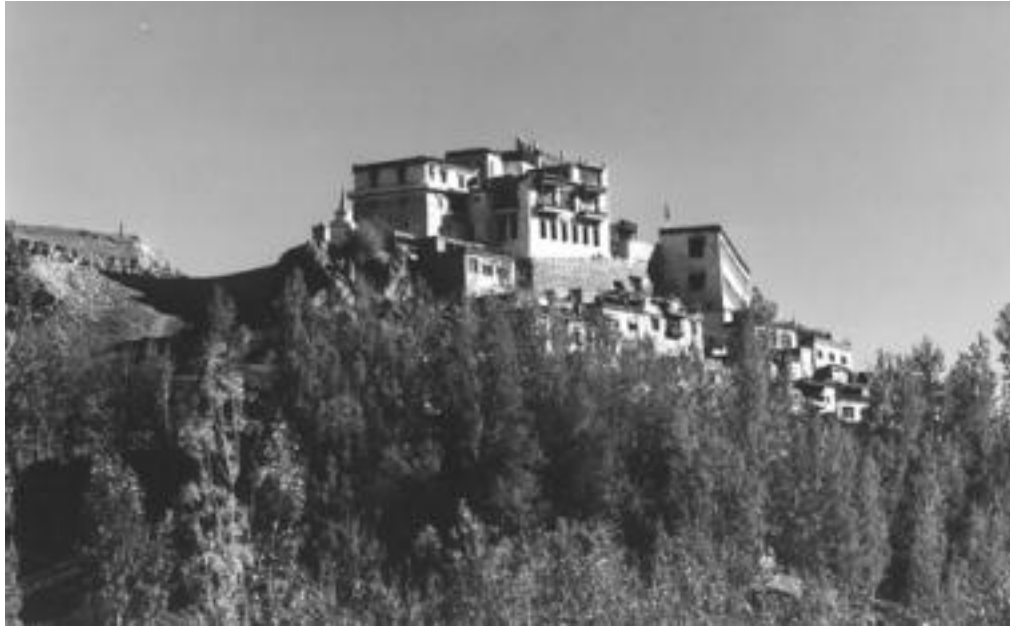
Fig. 1 — The Sakya monastery of Matho