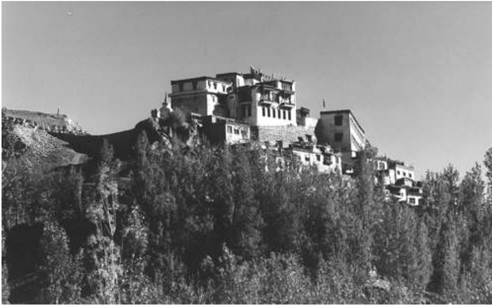
Fig. 1 — The Sakya monastery of Matho