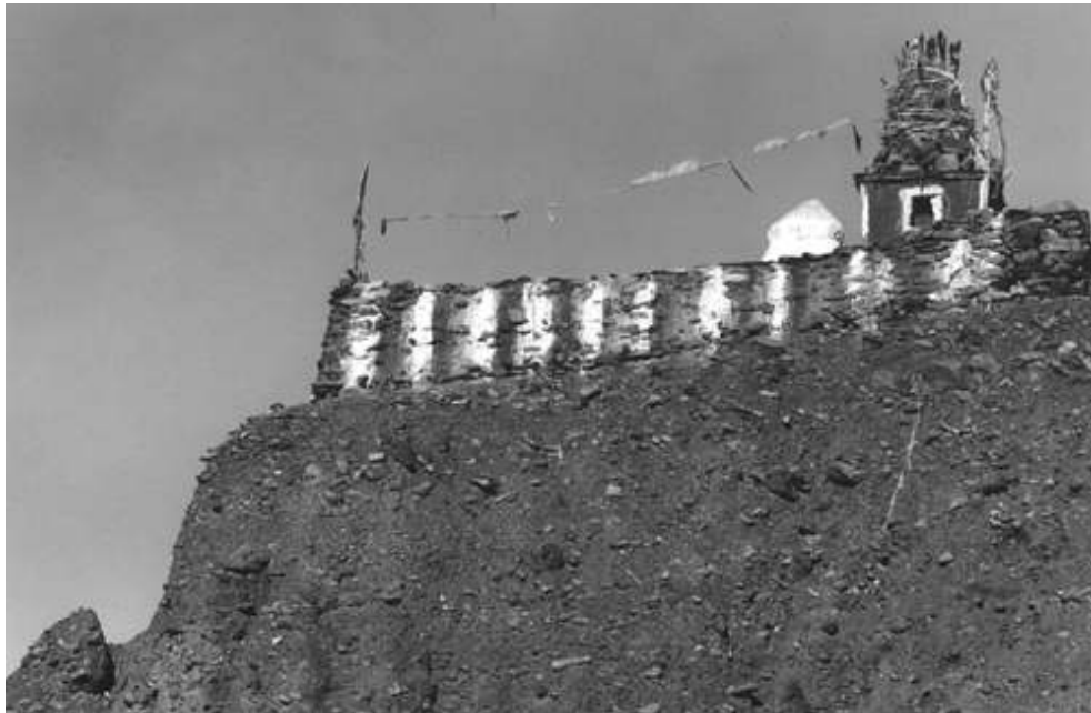
Fig. 2 – The Lchags rang shrine in Rumtse

single construction for both the White and Red Lchags rang, is also quite impressive (fig. 2). It is surrounded by low stone-walls painted with grey, white and red stripes curiously reminiscent of the way Sakya buildings are painted in Tibet, a motif that is quite unusual in Ladakh. Within the enclosure a whitewashed stūpa , a long prayer wall and the shrine itself stand side by side. The structure is crowned by a bunch of Ephedra Gerardiana planted with a dozen spears. The latter, given to the gods by the king (or his representative) and faithful inhabitants, are tipped with triangular iron-shaped heads. Moreover, the shrine presents another noteworthy particularity. Each face of the cubic base comprises a niche in which an anthropomorphic mask, 15-20 centimetres high, made of clay has been set (fig. 3). The inhabitants call these masks zhalbag ( zhal 'bag ), the honorific term usually given to any kind of mask whatever the manufacturing process or the ritual context may be, and present them as the faces of the gods. This kind of mask, kept inside votive cairns where local deities are worshipped or summoned, does not seem to be very widespread in the Tibetan area, 19 and I do not know any other examples of this practice in Ladakh.