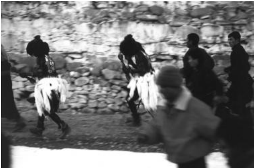
Fig. 5 – Nag rang Festival