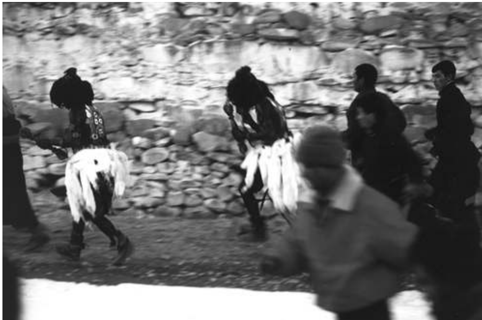
Matho monastery, 1997